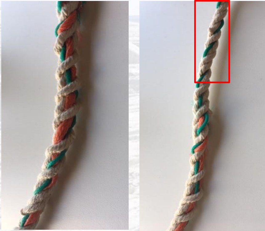
Interlacing Coloured Twine Within Existing Rope